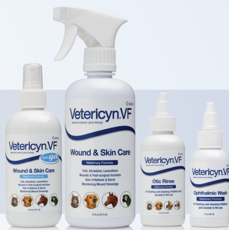
available in a variety of sizes and applicator types

For veterinary testimonials, clinical data, product information, and ordering: visit vetericyn.com